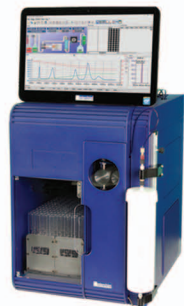
puriFlash® XS 420